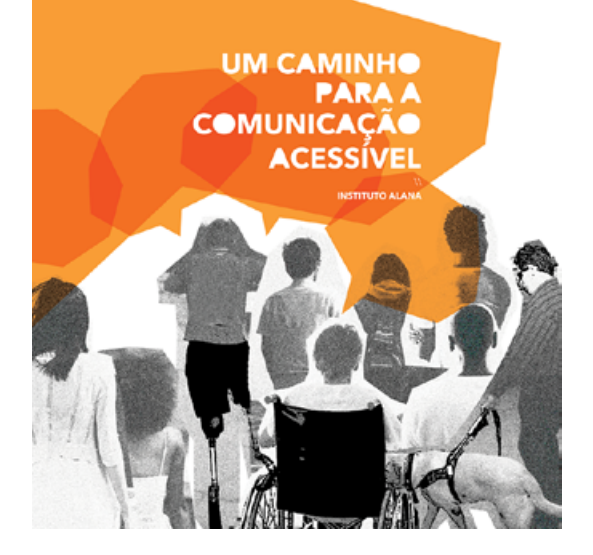
Paths and learning for an accessible communication