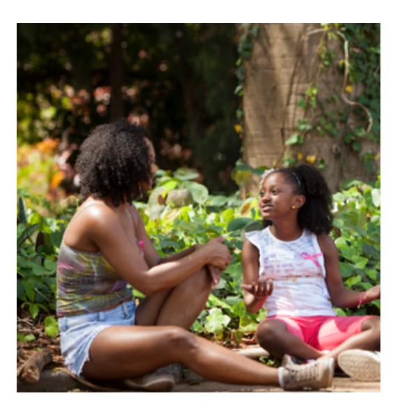
We have built important bridges and partnerships with the Sesc network, the ICMBio, municipal governments – such as Jundiaí (SP) and Boa Vista (RR) – including some schools.

In June, we gathered more than 400 specialists and educators from all over the country during the IV Child and Nature Seminar, held in Rio de Janeiro in partnership with Sesc.