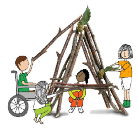
We have released the Camping with Kids Guide to encourage everyone to sleep under the stars and disconnect (a little bit!). <u>Check it out!</u>

inclusion of a chapter dedicated to children in the master plan of the city of Jundiaí, located in the interior of São Paulo. And we keep moving forward.