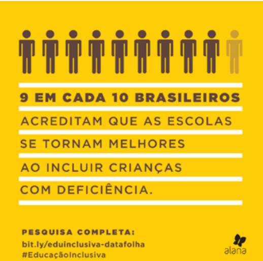
Exclusive research: Brazilian population and inclusive education - Learn more