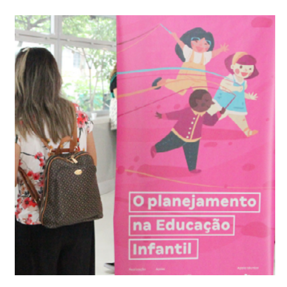
500 planning for experiences in childhood education - Learn more