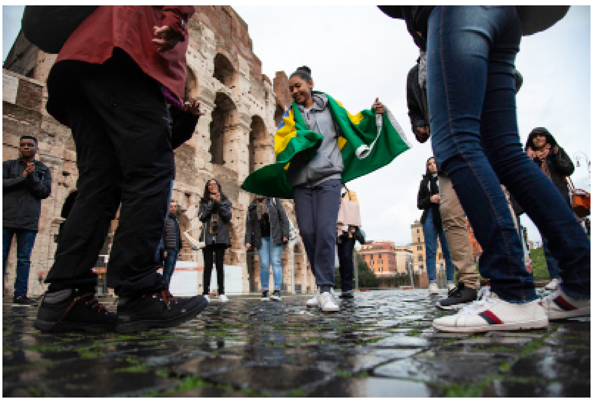
Brazilian students dancing in Coliseu, em Rome.