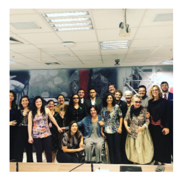
The Brazilian Network for the Inclusion of Persons with Disabilities (Rede-In)