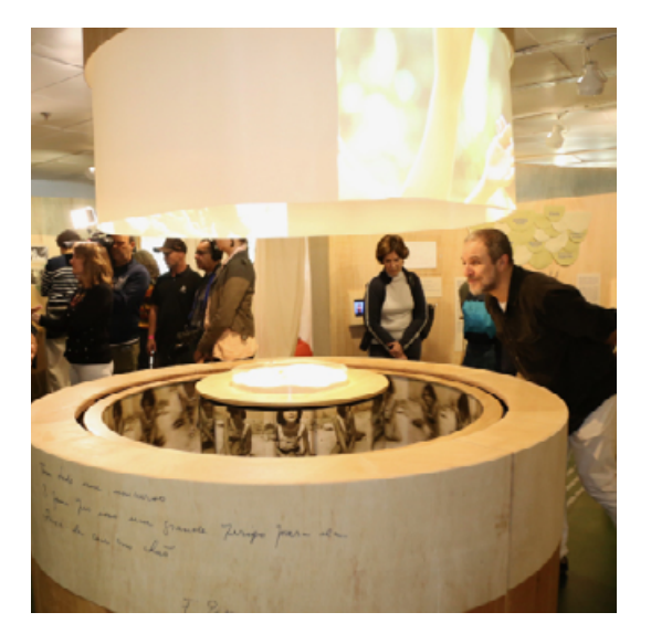
Launching of the Exhibition on Lydia Hortélio Occupation