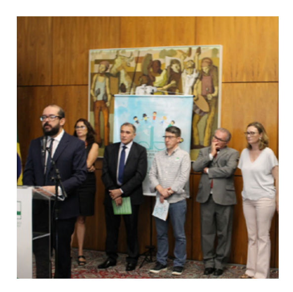
Participation in the launching of the Mixed Parliamentary Front for the Promotion and Defense of the Rights of Children and Adolescents